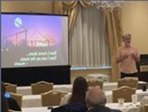
Boston Conference 2022

Awards are granted on a competitive basis and winners are selected by committees in Ireland and North America. Recipients are required to attend our annual meeting and present their papers.